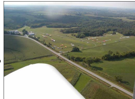
2ND Day Field Overview