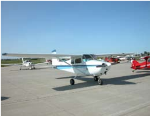
Dave's old 172 at breakfast