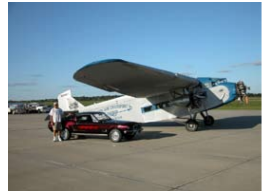
Old mustang and Tri-Motor