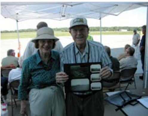
He flew on a triebster city