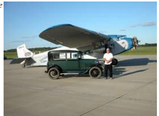
Model A and the Tri-Motor