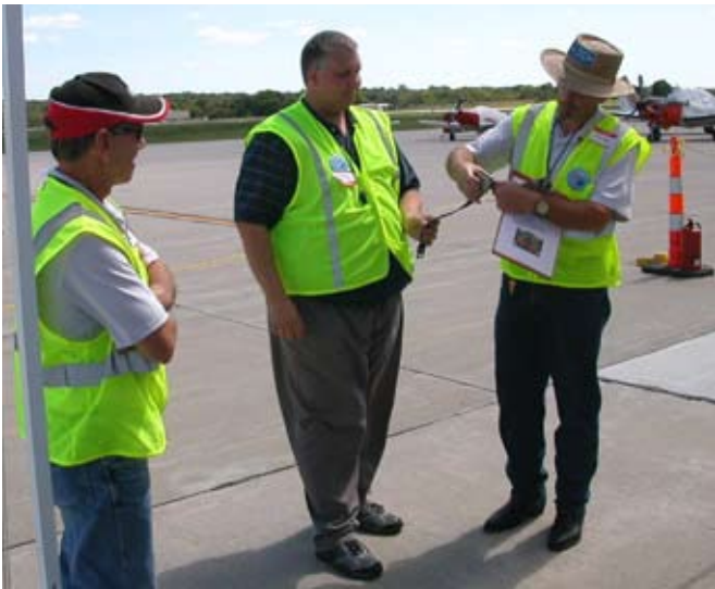
Bocox Kalwishky fling