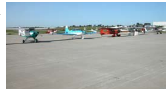
Planes at flight-breakfast