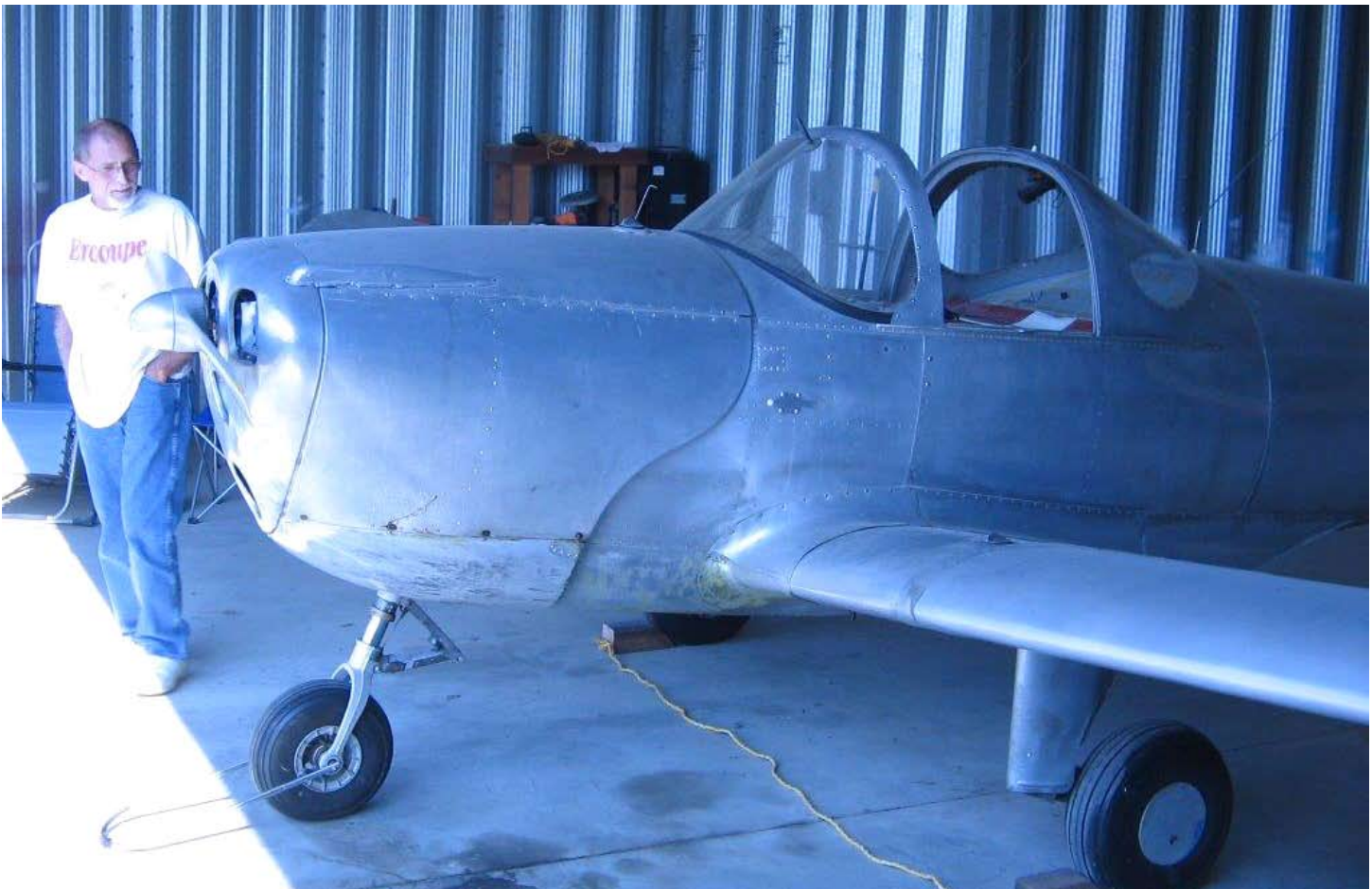
Jack Arthur looks at an Ercoupe project at Wahoo NE