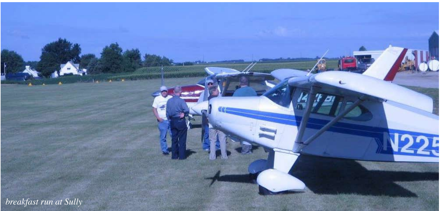
breakfast run at Sully