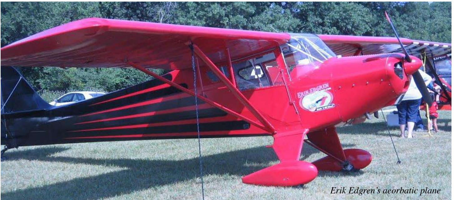
Erik Edgren's aerobatic plane